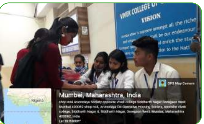
VOTERS ID DRIVE