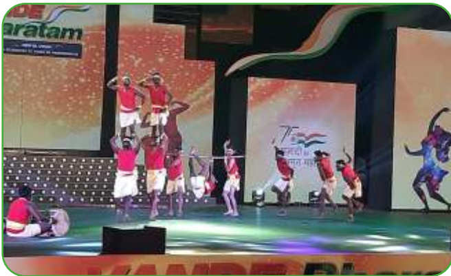
FOLK DANCE TEAM OF VANDE BHARATAM NRITYA