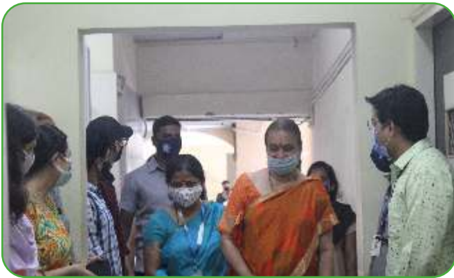
INAUGURATION OF MEDIA ROOM