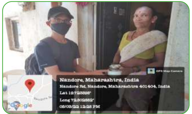
NSS STUDENT AT NANDORE VILLAGE