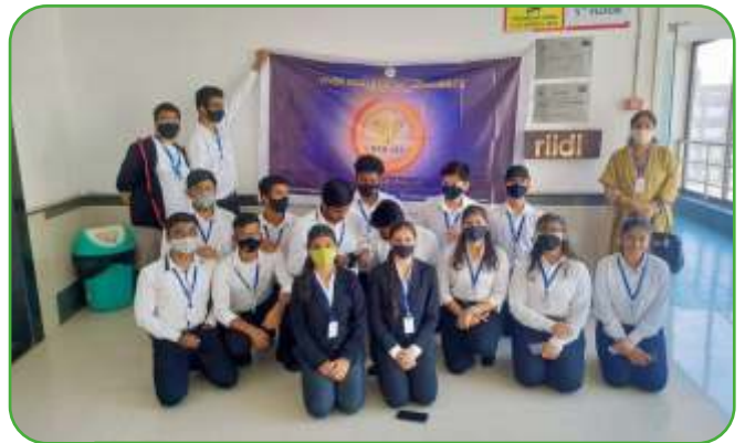
MERAKI VISIT TO A COLLEGE