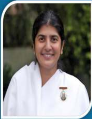
Chief Guest & Keynote Speaker B K Shivani World Renowned Motivational Speaker