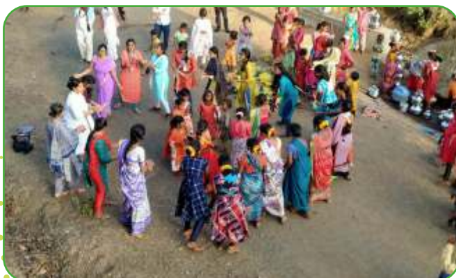
VIVEK YUVA CLUB VISIT AT NASHIK