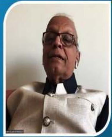
Guest of Honour Hon'ble Justice Dr. S. Radhakrishnan Former Judge of the High Court of Bombay