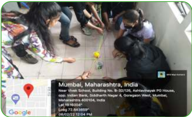
MANAGEMENT GAMES BY MERAKI