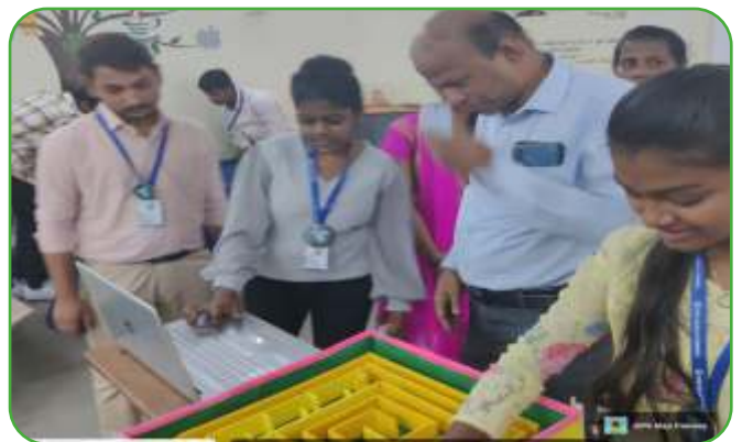
I.T. EVENT - CURIOSITY