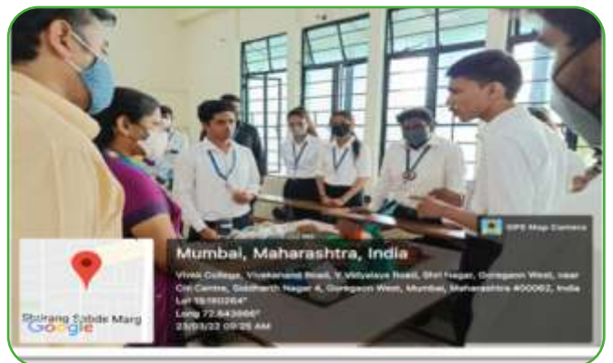
PRAKRUTI EXHIBITION BY BMS STUDENTS