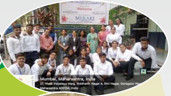
Mumbai, Maharashtra, India

Delhi Secretariat, IG Indoor Stadium, ITO, Vikram Nagar, New Delhi 110002, India Lat 28.630829°