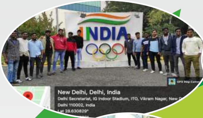
New Delhi, Delhi, India

Delhi Secretariat, IG Indoor Stadium, ITO, Vikram Nagar, New Delhi 110002, India Lat 28.630829°