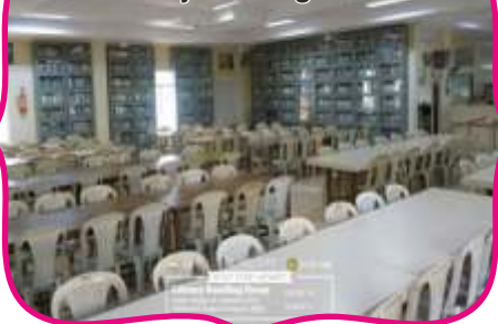
Library Reading Room

Sundays/ Holidays: 9.00 a.m. to 8.00 p.m.