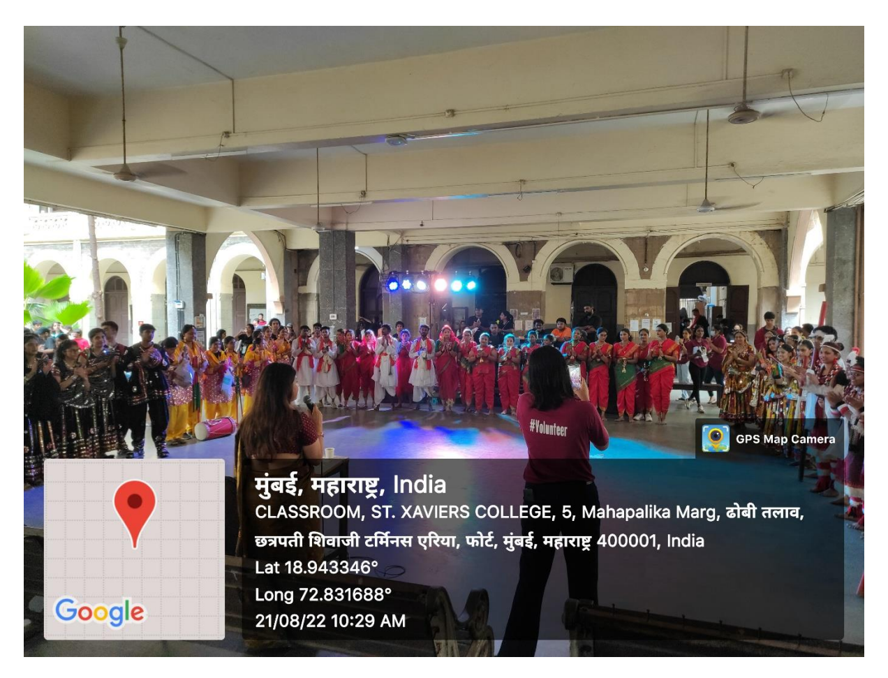
Winner of Malhar Festival 2022 organised by St. Xaviers College Autonoums