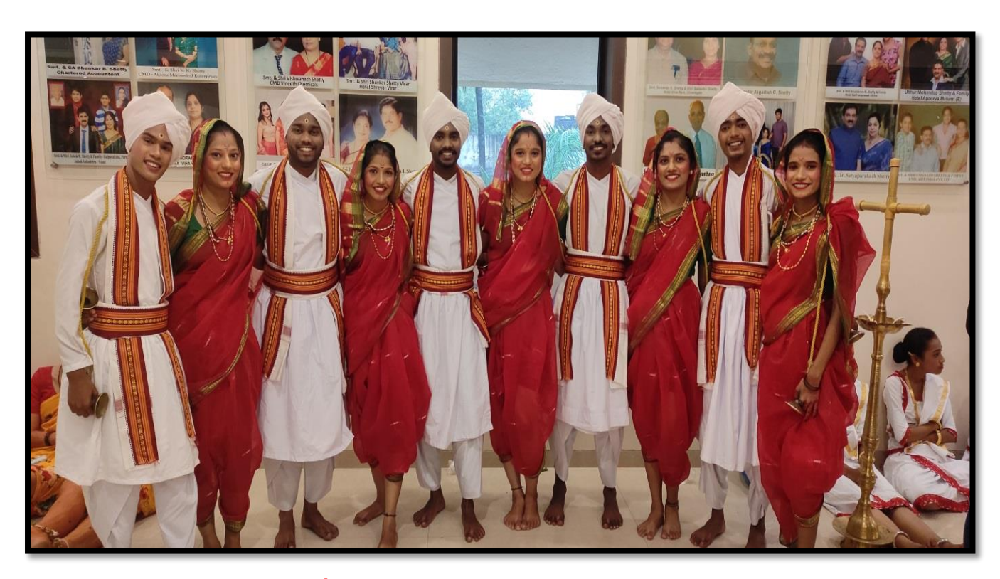
Silver Medallist in the 55^{th} Mumbai University Youth Festival for Indian Folk Dance

Students Attended the Yuvak Biradari Dance Drama