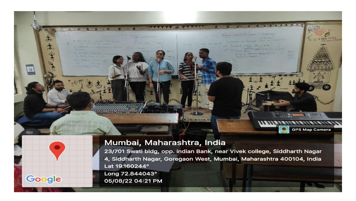
1st Prize in Zonal Round of Mumbai university 55th Youth Festival