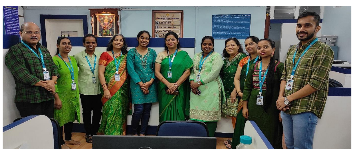
Navratri with Colours