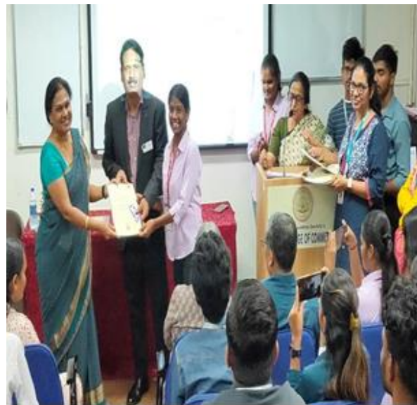
Session on “STOP-Child Sexual Abuse POSCO Act,2012