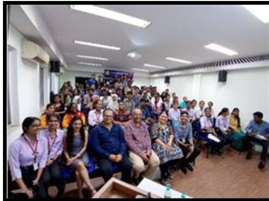
Seminar on “Developing HR skills”