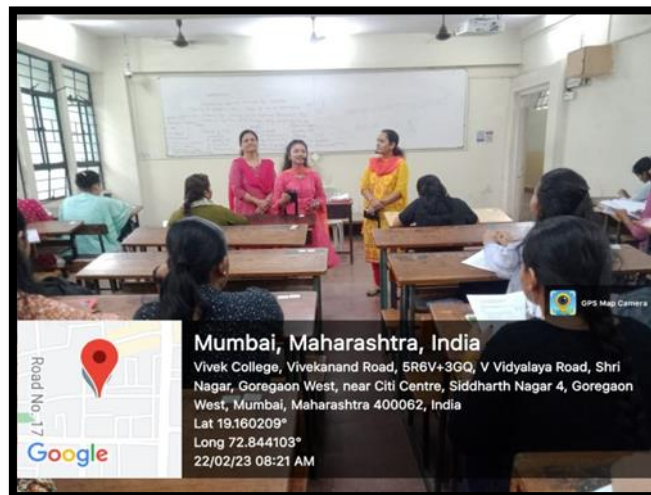
Practical training in filling up research questionnaires.

5. On the occasion of World Consumer Rights Day, a session on ‘Consumer Awareness’ was conducted by Commerce Department for TYBCOM students and FYBAF. The Guest speaker