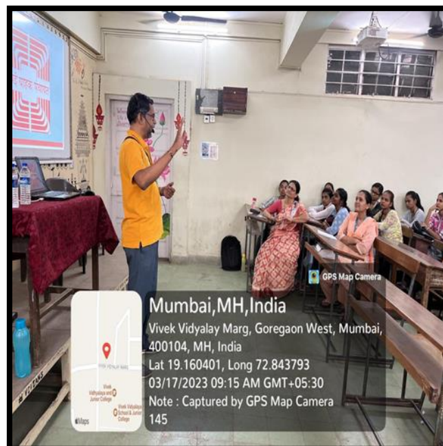
A session on 'Consumer Awareness