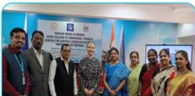
International Conference in collaboration with Russian Centre for Central Eurasian Studies, University of Mumbai