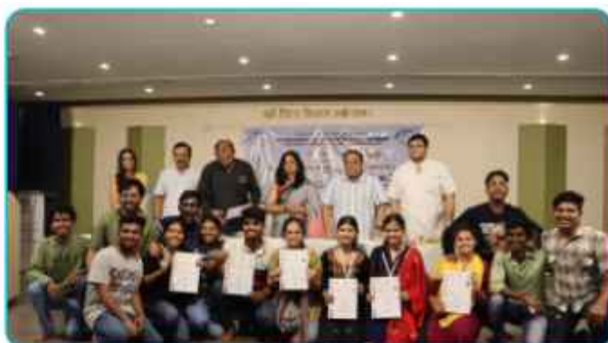
MUMBAI UNIVERSITY YOUTH FESTIVAL