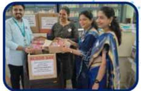
PROJECT AASHRAY NATURAL CALAMITY RELIEF ACTIVITY