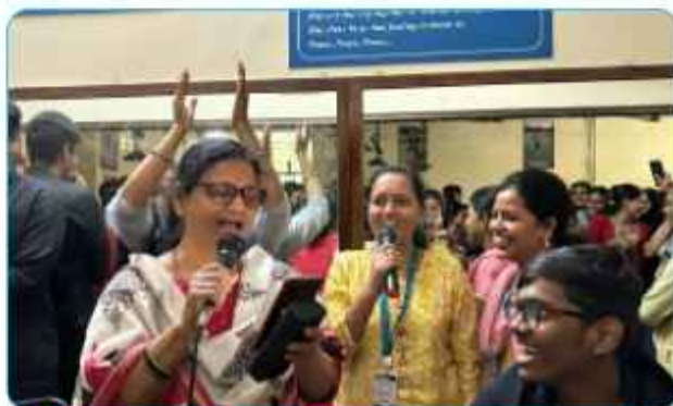
PATRIOTIC JAMMING MUSICAL SESSION