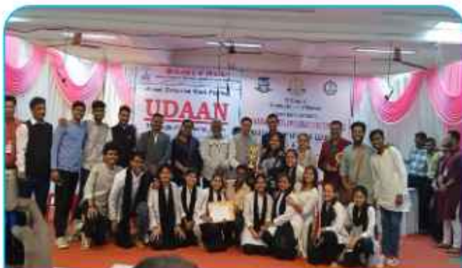
Winners at Udaan Festival of University of Mumbai