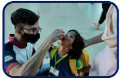
PROJECT AAROGYAM HEALTH & IMMUNISATION ACTIVITY