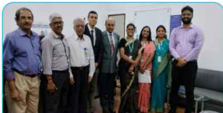
ISO 21001:2018 Certification Audit by TUV Austria