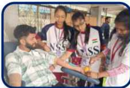
PROJECT ARPAN BLOOD DONATION & ORGAN DONATION ACTIVITY