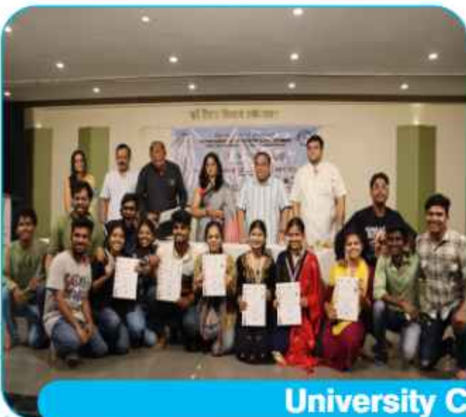
University Cultural Event