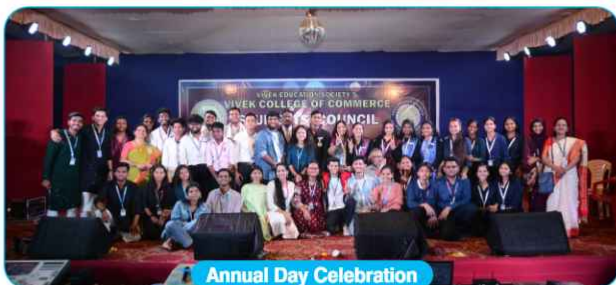
Annual Day Celebration