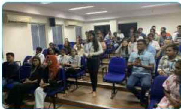
BUSINESS CANVAS MODEL MERAKI