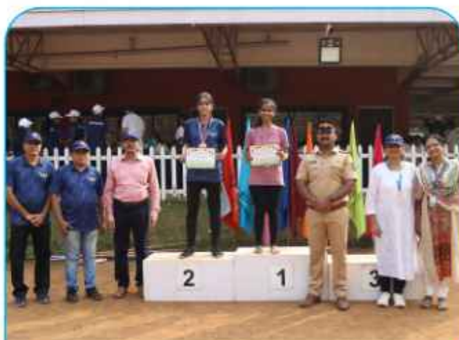
Annual Sports Day Prize Distribution