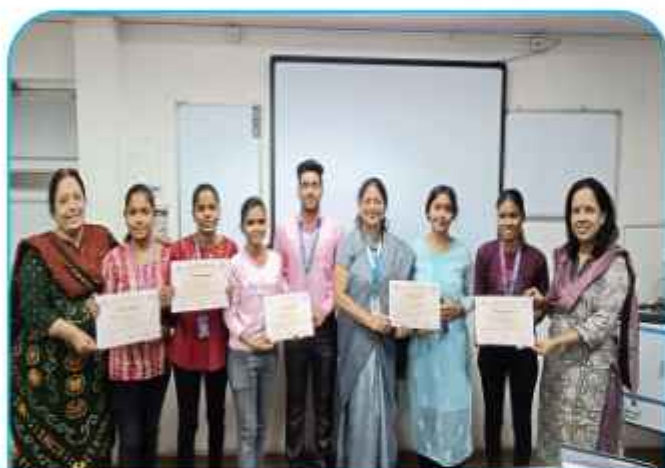
First Prize in Girls Box Cricket Tournament Organized by G. Jalan College