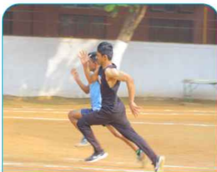
Annual Athletic Meet 2023-24