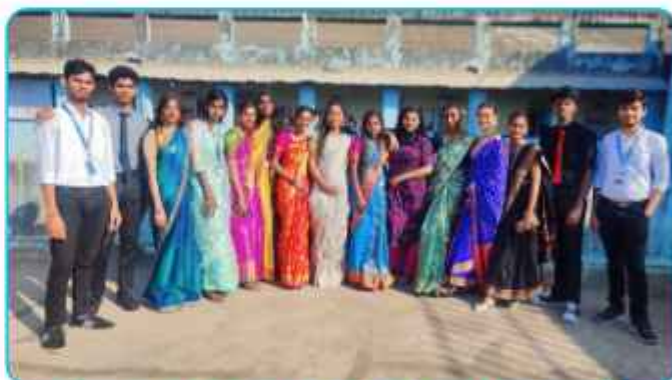
TIE & SAREE DAY CELEBRATION