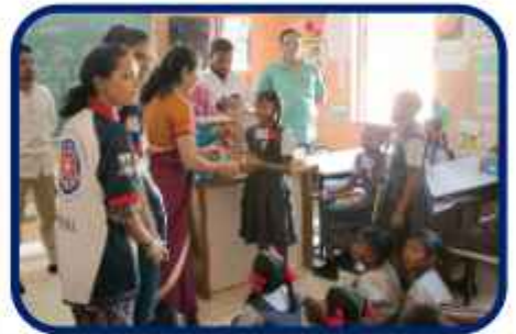
PROJECT ANNADHANAM FOOD DISTRIBUTION ACTIVITY