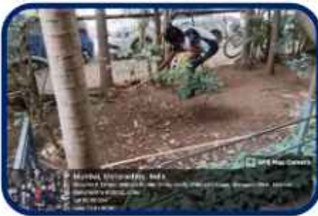
PROJECT ANKUR GARDENING, TREE PLANTATION & MAINTENANCE ACTIVITY