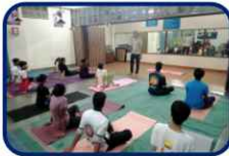
PROJECT AAYUSH YOGA & WELLNESS ACTIVITY