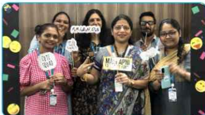
FRIENDSHIP DAY CELEBRATION

PSO2- The Learning of SM subject can bring concept clarity, focused and deep understanding of SM applicable to organisations and can also motivate students to start their own start ups.