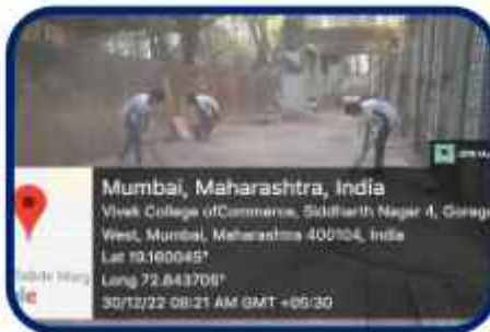
PROJECT AADVIK REFURBISHING, REDESIGNING ACTIVITY