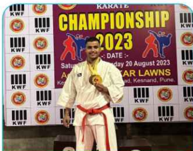
Gold Medal at State Shotokan Karate Championship at Wagholi Pune & Silver Medal at State Global Shotokan Karate Championship at Decathlon Pune