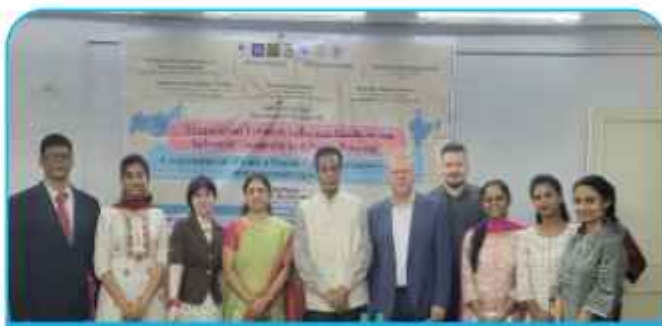
International Conference in collaboration with Ministry of Education & Science of the Russian Federation