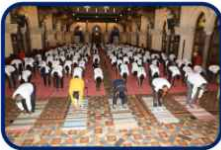
PROJECT AARUSH SURYANAMASKAR ACTIVITY