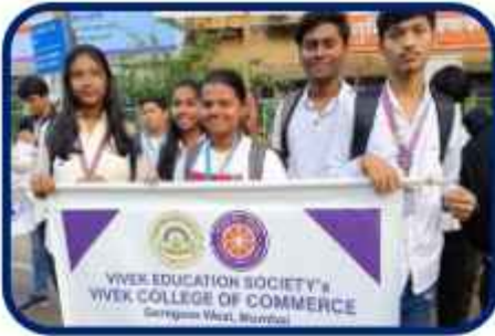
PROJECT AKHAND BHARAT NATIONAL DAY CELEBRATION ACTIVITY