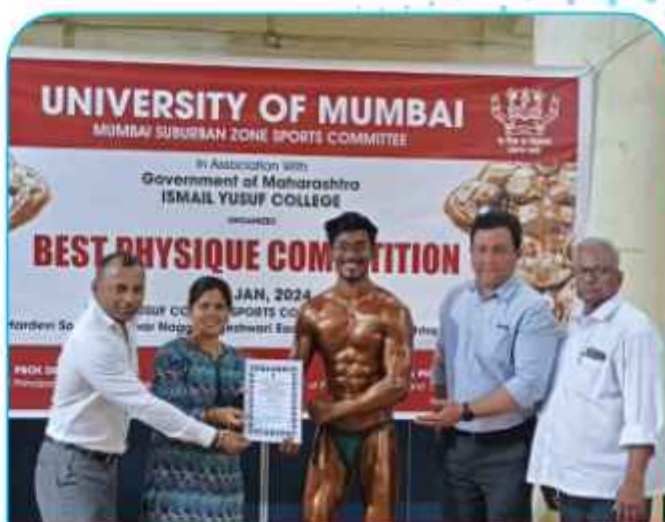
Gold Medal in 65 Kg weight category at University Best Physique Competition 2023-24