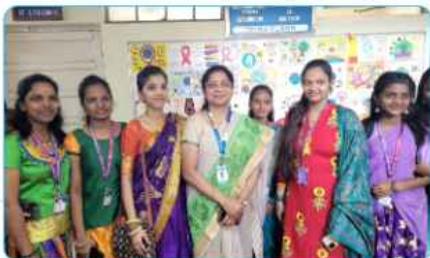
TRADITIONAL DAY CELEBRATION