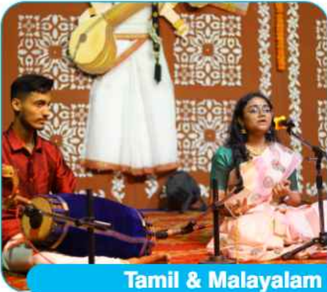
Tamil & Malayalam Literary Association