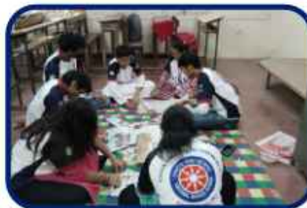
PROJECT AVANI ENVIRONMENTAL ACTIVITY