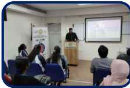
PROJECT AADISH EDUCATIONAL ACTIVITY