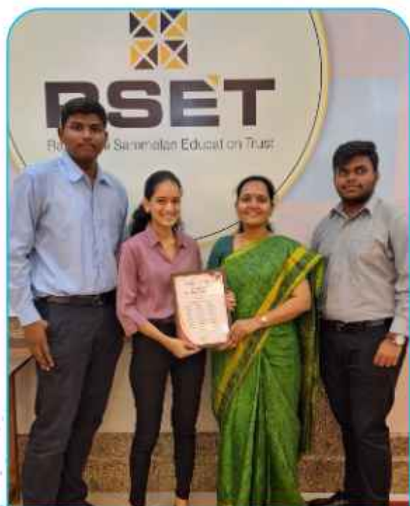
Best Research Paper Award to students at RSET.