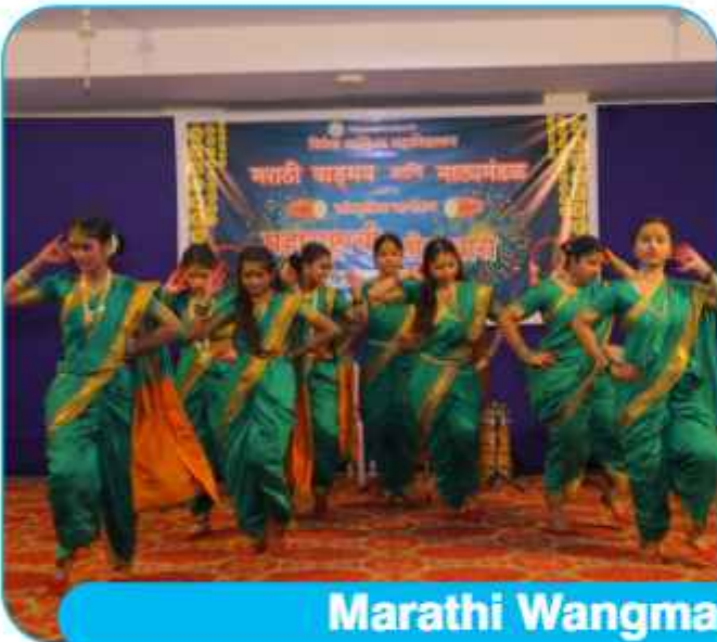
Marathi Wangmay & Natya Mandal