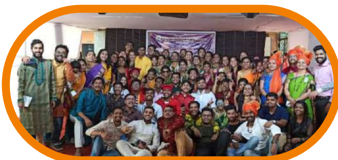
MARATHI WANGMAY MANDAL