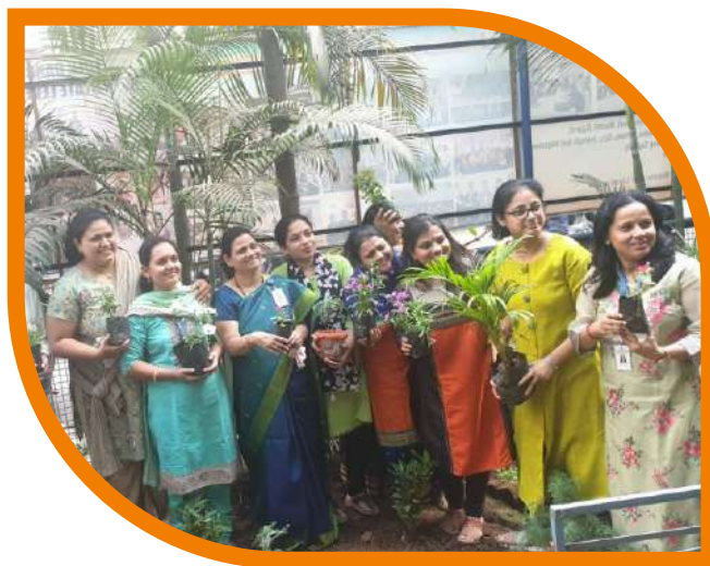
GREEN VALENTINE DAY