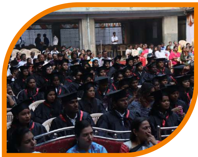
DEGREE DISTRIBUTION CEREMONY