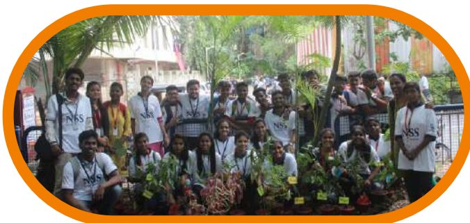
TREE PLANTATION BY NSS