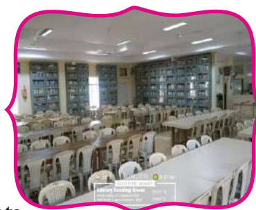
Library Reading Room