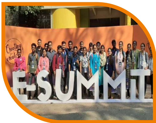
“E-SUMMIT” IIT BOMBAY